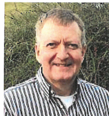
Stephen (CAP Debt Coach)

Client story – name not used to protect identity C's story