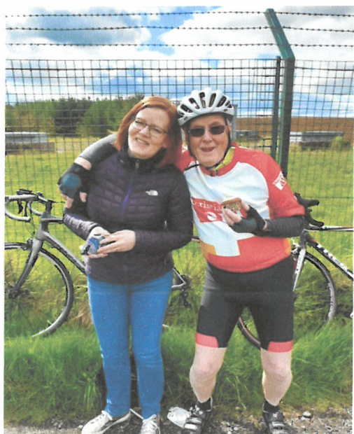
Support team to lean on!!