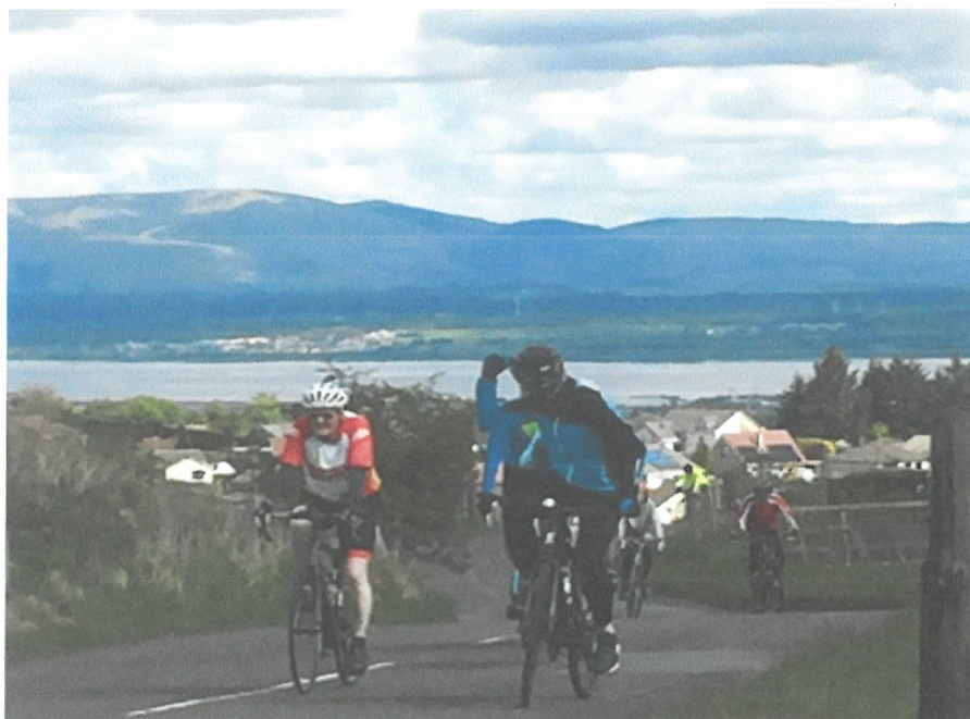
A race to the top of the climb!!