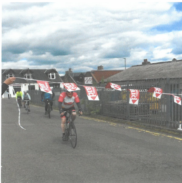
The finish line